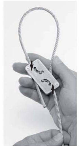
Step 5 To adjust, remove tension and pull wire rope slightly to disengage teeth, slide adjustment pin in direction shown by arrow to release wire rope