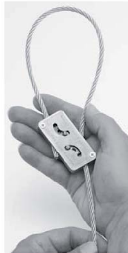
Step 4 Apply tension on wire rope