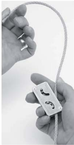
Step 2 Loop wire rope through/around support