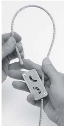
Step 3 Pass wire rope back through KwikWire™ Clamp