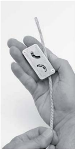
Step 1 Slide the adjustment pin and pass the wire rope through the KwikWire™ Clamp